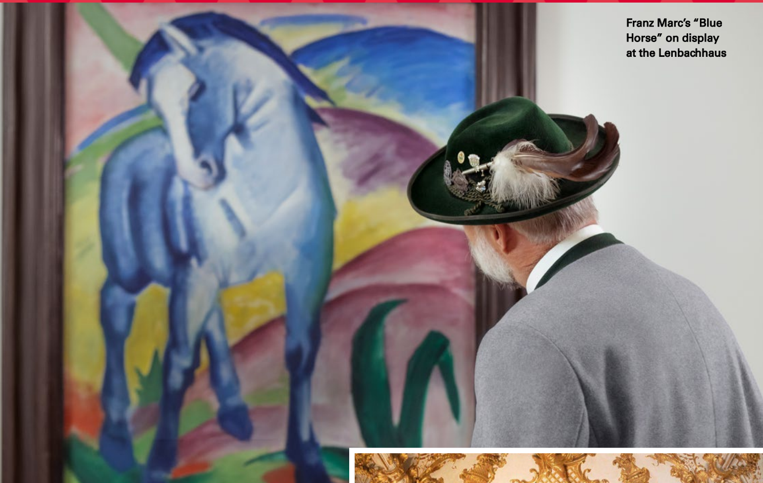
Franz Marc's "Blue Horse" on display at the Lenbachhaus